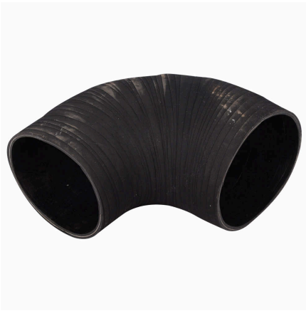
TRP-7002 MERCEDES 0403 TURBO HOSE