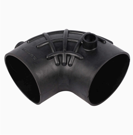
TRP-7001 MERCEDES TRAVEGO TURBO SUCTION HOSE (OLD MODEL)