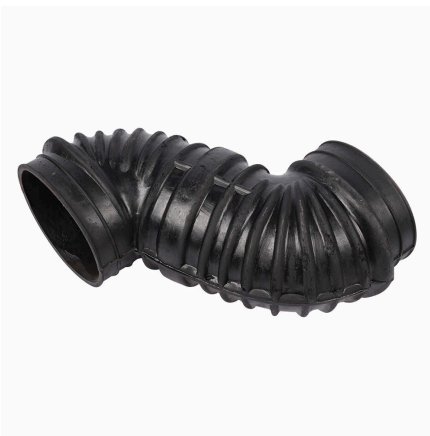
TRP-7003 MERCEDES V8 S HOSE