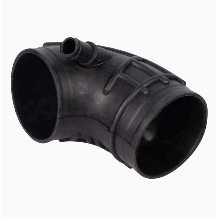
TRP-7000 MERCEDES TRAVEGO TURBO SUCTION HOSE (NEW MODEL)